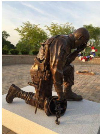
Kneeling soldier Centerpiece.